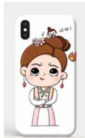
mobile phone shell