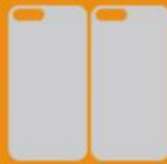
PUT IN PLACE