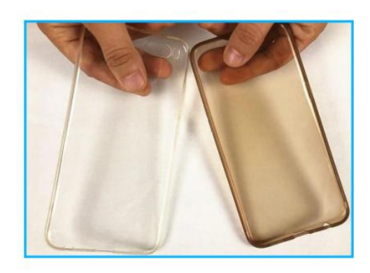
Does not turn yellow and hard